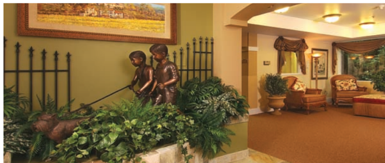
KINGSWOOD COURT • MEMORY CARE