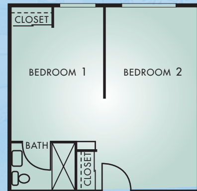
SHARED APARTMENT • 415 SQUARE FEET

We understand that each resident is unique, which is why a specialized service plan is designed and tailored to meet your loved one's individual needs.