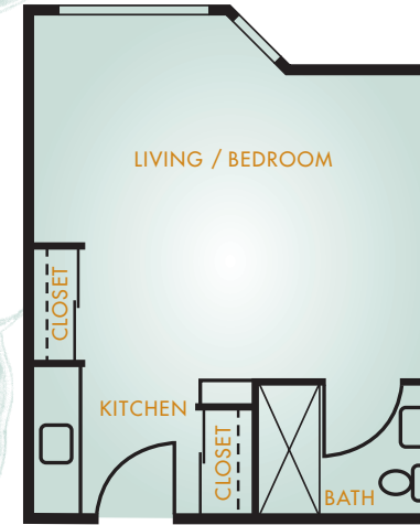
STUDIO • 330 SQUARE FEET FROM $2730